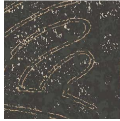
760 SMOKEY QUARTZ